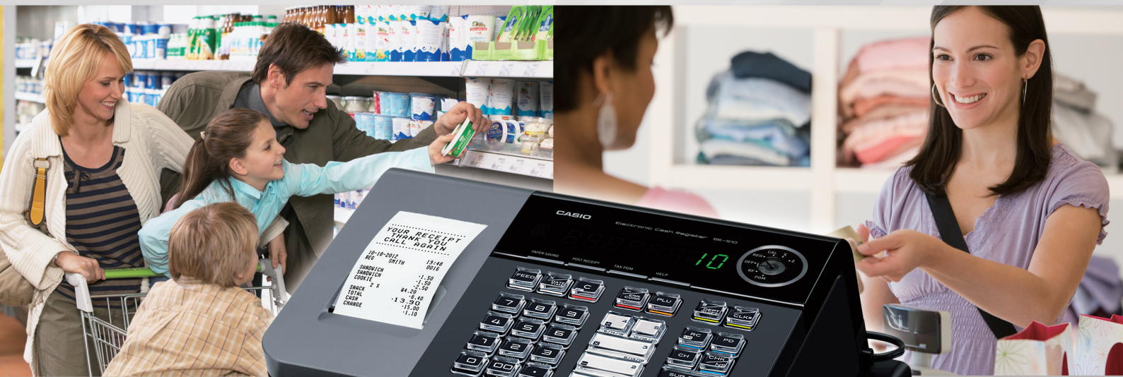
Small drawer model

The SE-S10 smart cash register combines convenience in setup and day-to-day operation with deluxe features such as a customer-friendly rear display and antimicrobial keyboard. This stylish, compact register suits any retail environment.